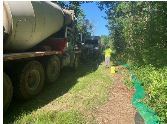
Photo 4: Grout Truck for Grouting of Annular Space in Easement Crossing