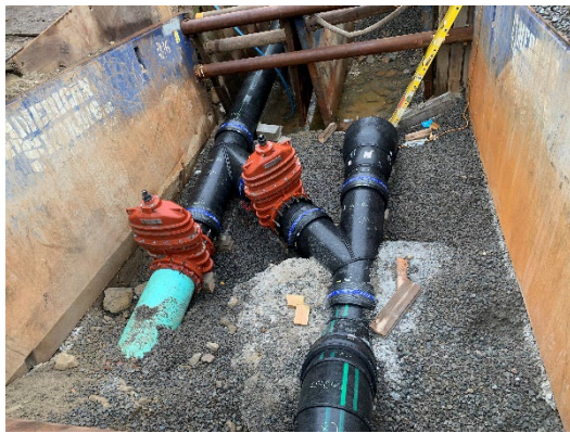
Photo 3: Force Main Tie-In Connection Progress at Auburn Street Pump Station