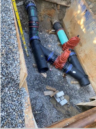
Photo 1: Force Main Tie-In Connection at Auburn Street Pump Station