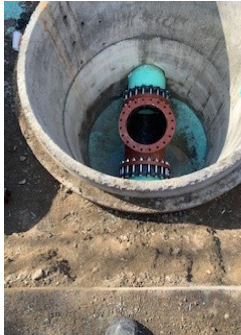
Photo 2: Installation of 20" Ductile Iron Tee Inside Air Release Manhole