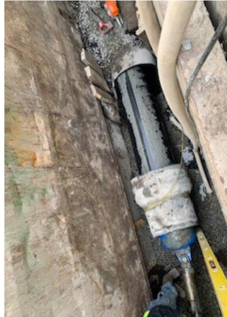
Photo 3: 20" HDPE Force Main Successfully Pulled across Beaver Brook