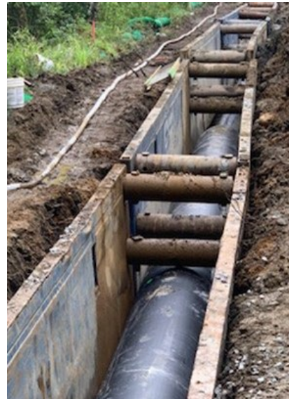
Photo 3: Close Up View of the 20-inch HDPE Sewer Force Main in Cross Country Easement