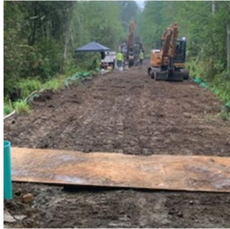
Photo 1: View of the Cleared Cross-Country Easement for Installation of 20-inch HDPE Sewer Force Main