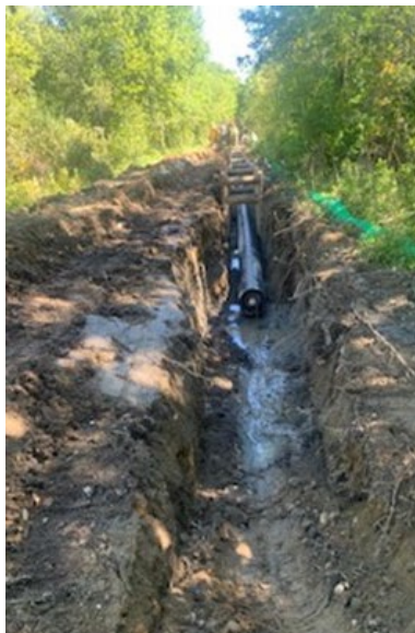
Photo 2: Installation of the 20-inch HDPE Sewer Force Main in Cross Country Easement