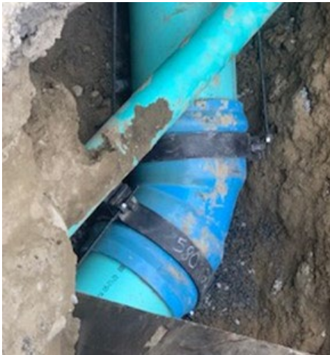
Photo 2: 20-inch PVC Sewer Force Main with 45 Degree Bend on Auburn Street