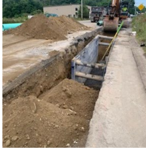
Photo 1: Installation of 20-inch PVC Sewer Force Main on Auburn Street