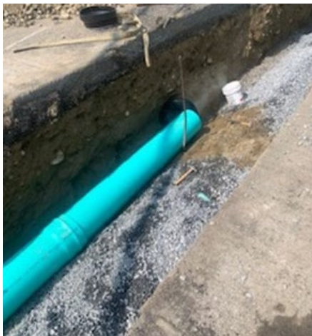
Photo 2: 15" RCP Drain Pipe Replacement with 15" PVC Pipe on Auburn Street